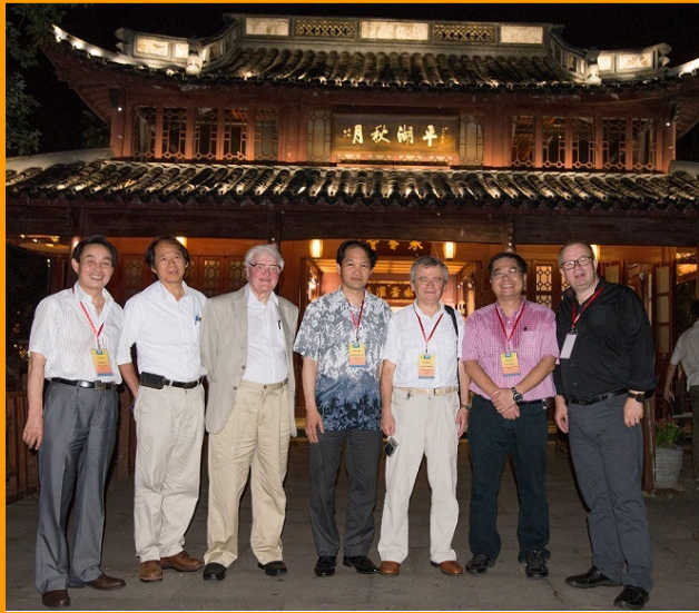
Hangzhou, West Lake, Tea Shop, June 2013

...and People's Republic of China in July.