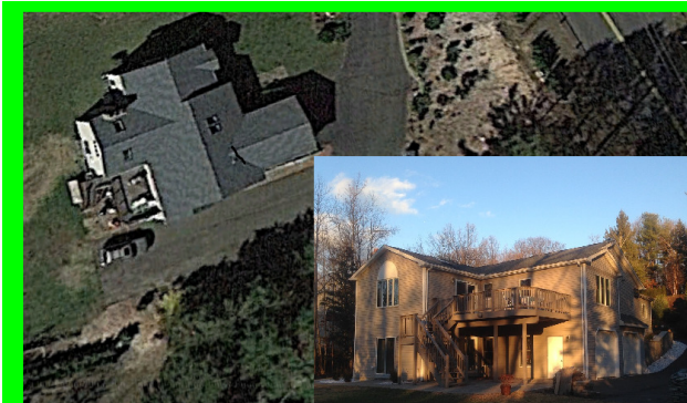
Our house in Glastonbury, CT.

We are happy to live our rural life in Glastonbury, Connecticut and occasionally in Loves Park, Illinois. So far we enjoy good health.