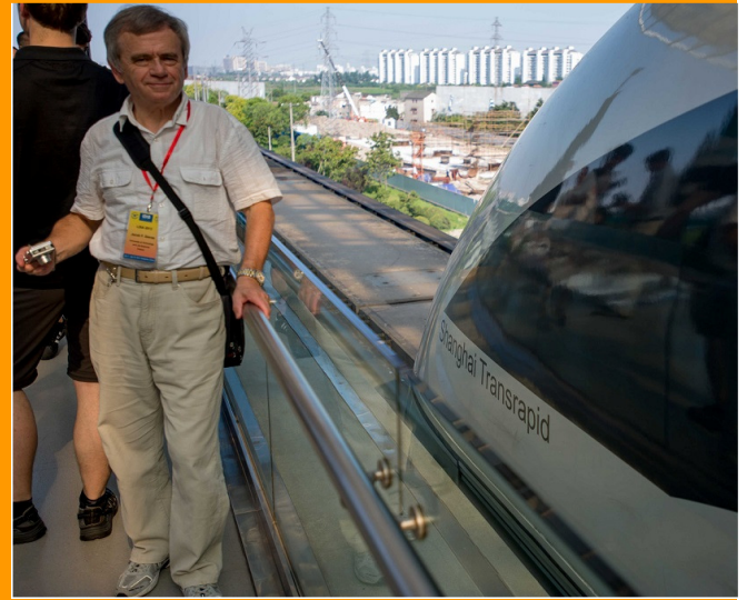
Shanghai. Maglev, June 2013.