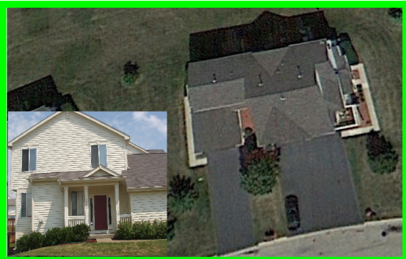
Our house in Loves Park, IL.