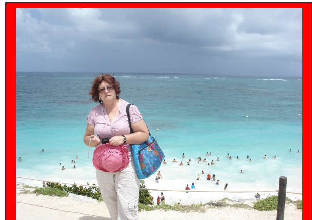
Tulum, Mexico, August 2013