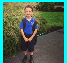
First day at school