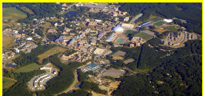
University of Connecticut, Storrs, CT