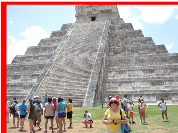
Chichenitza, Mexico, August, 2013